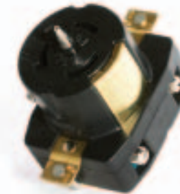
SAFEWAY® SINGLE RECEPTACLE