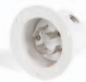
SAFEWAY® FLANGED INLET