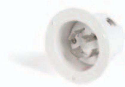
SAFEWAY® FLANGED INLET